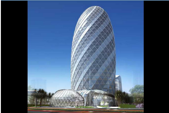
Pearl Tower, Soi Aree, Phaholyothin Road, Bangkok, Thailand