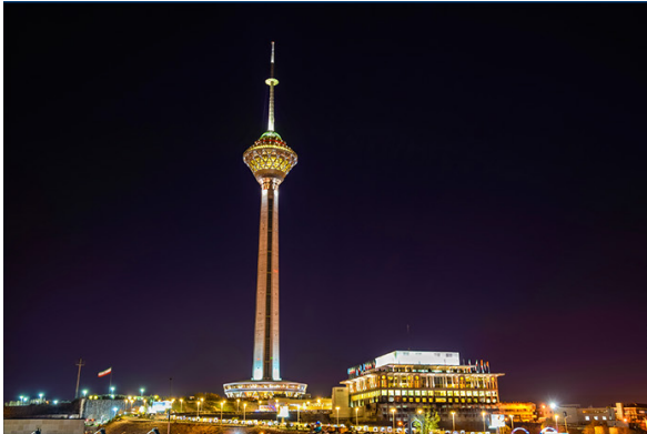
Milad Tower, Tehran, Iran