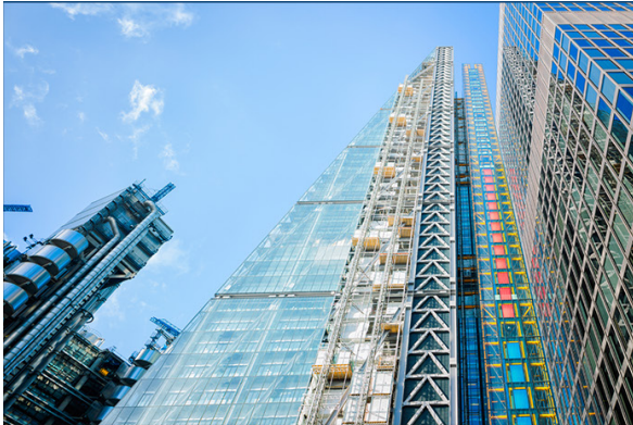
Leadenhall Building, 122 Leadenhall St, London EC3V 4AB, United Kingdom